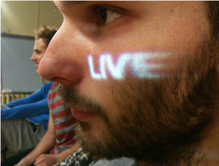
Projection from Hangout session on LKA student's face

compounded when the director of the venture is a guest artist from a different culture. 16