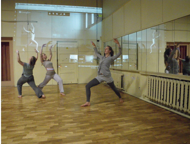
LKA dancers with projection of ISU dancer, image by Paul Zmolek

narrative, the work (and the process) is multi-directional with multiple centers of activity filtered through varying points of view sharing space and time.